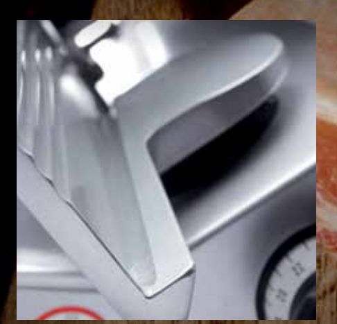
Drain on gauge plate: reduces the risk of bacterial contamination caused by residual liquids.

Its high product quality is the result of systematic Global Quality Management. Like no other manufacturer, Bizerba is more than familiar with practical applications since we are totally committed to close customer support, competent advice and we have a large reliable service network. In this way, the lessons learned flow directly into technological innovations.