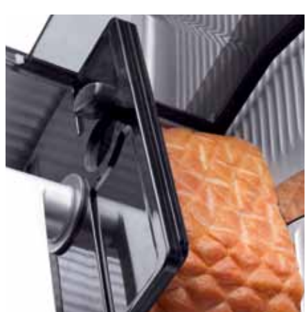
Remnant holder flexibly adjustable to cut products of all types: optimised product feed with universal applications.