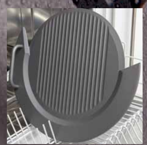
Removable parts can be cleaned in the dishwasher