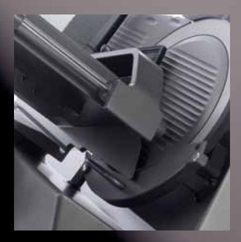
30 times more resistant to abrasion.