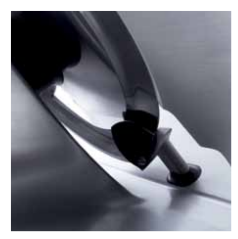
One-piece blade guard ring with integrated attachment: easy to clean and attached seamlessly by fixing elements to machine housing.