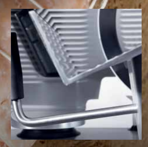
Carriage handle attached directly to carriage base: no joints mean it is easy to keep the machine hygienically clean.