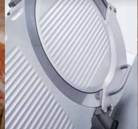
Blade cover and deflector: deflects sprayed particles from the product and is easy to remove together with fixed parts for cleaning.