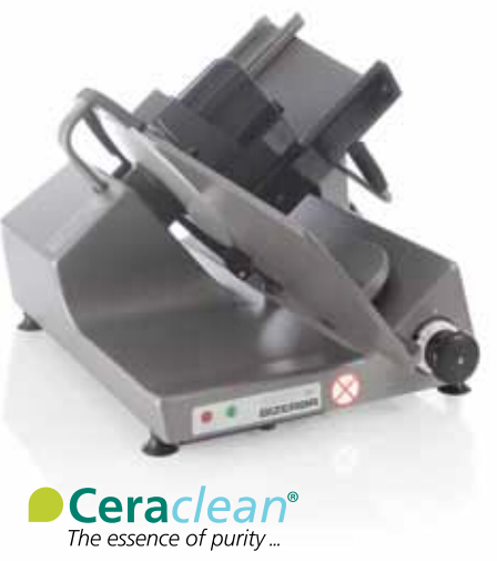
GSP H 18°