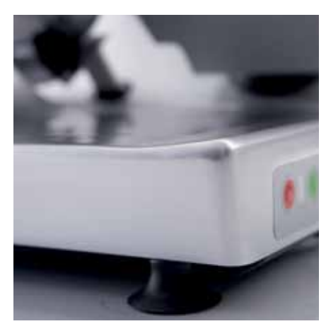
Raised up on machine housing: no uncontrolled dripping from the product tray to the counter or floor.