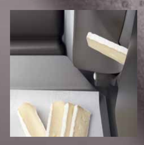
20% increase in gliding properties.