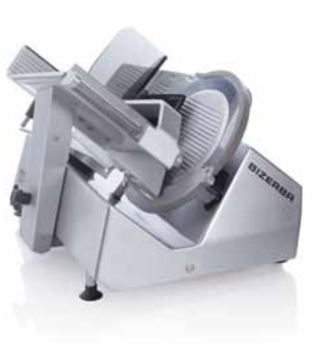
GSP H 18°